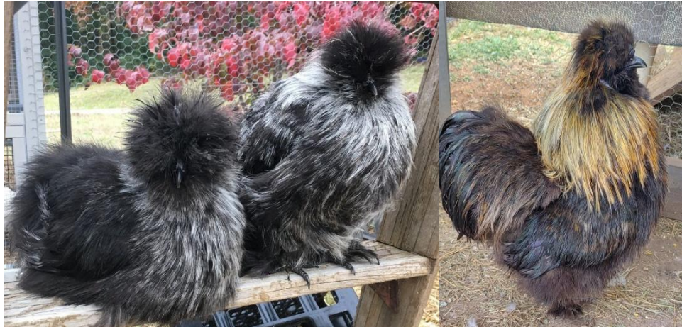
Silver Female & Male