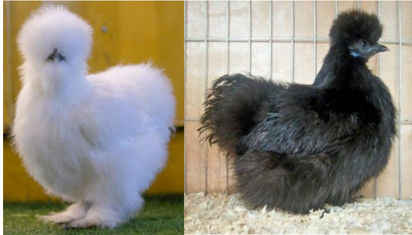
Large Bearded Silkie 322 — Large Un-bearded Silkie 324