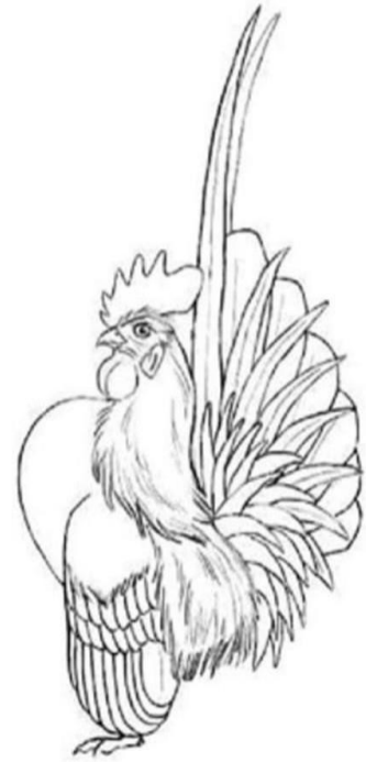
Cock- 16 oz/455 grams Cockerel- 14oz./398 grams

Breast: Highly lifted, well developed, full, carried prominently forward beyond vertical line drawn from point of beak, broad and well rounded, from head to neck to breast "S" shaped profile.